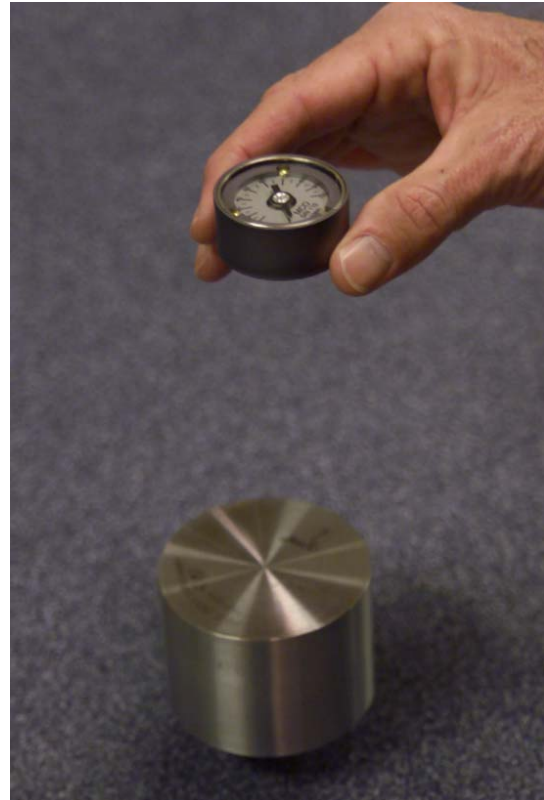
Photograph of a 100-psi Readout Unit held 8 in. above a 600-psi Sender Unit

The technology and any systems implementing the technology are the proprietary intellectual property of Vista Research, Inc. A patent is pending on the technology. A three-phase program was undertaken in 1999 with Fluor Hanford, Inc., to develop the implementation of this technology for the MCOs. The first two phases were performed by Vista Research, and the last phase is being performed by Vista Engineering Technologies, a spin-off of Vista Research. In the first phase, a workable design was developed. In the second phase, an engineering prototype was built and tested to validate the performance of the system. The third phase is to manufacture and deliver MCPGs.